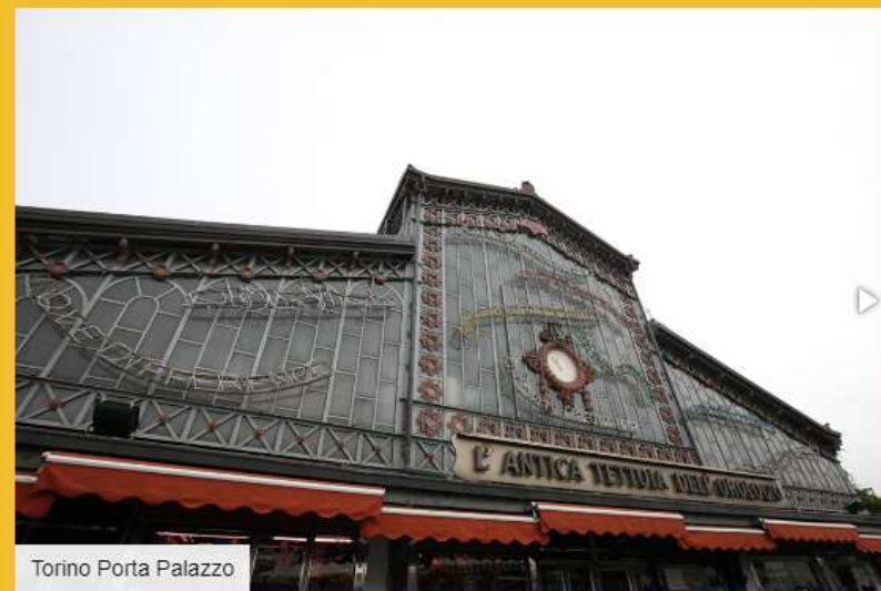
Torino Porta Palazzo