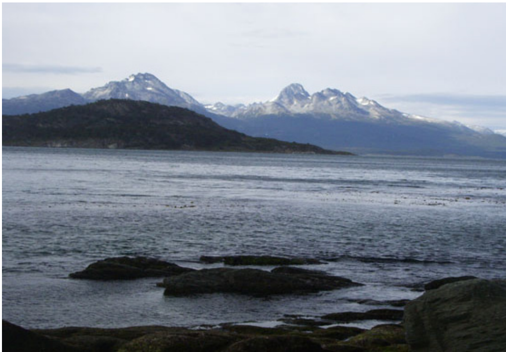
Tierra del Fuego National Park

3. In 2011, the expedition RAPAPATATIERRA initiated by a group of Romanian specialists and supported by Vacations and Travel magazine, walked in the footsteps of Romanian explorers