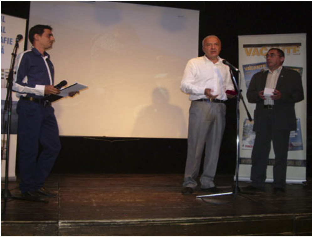
The National Salon for Tourist Photography supported by Amphitheatre Foundation