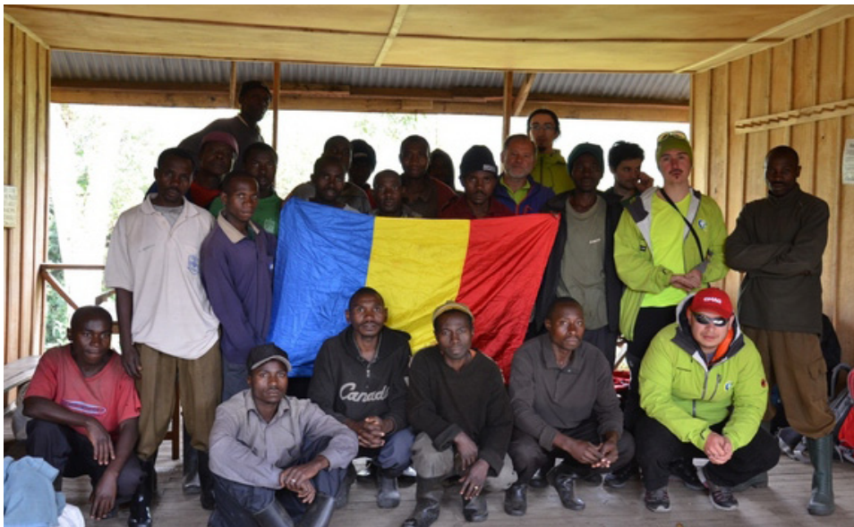
The Romanian climbers team on the African base